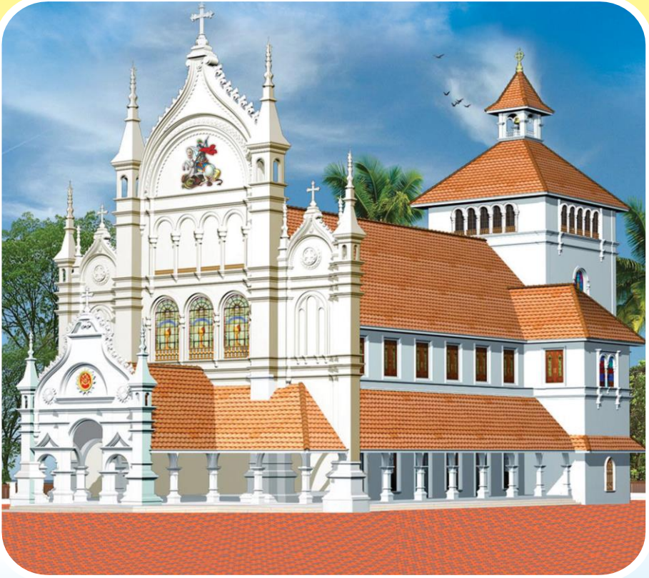
KALKKUNNEL MAR GEEVARGHESE SAHADA CHURCH