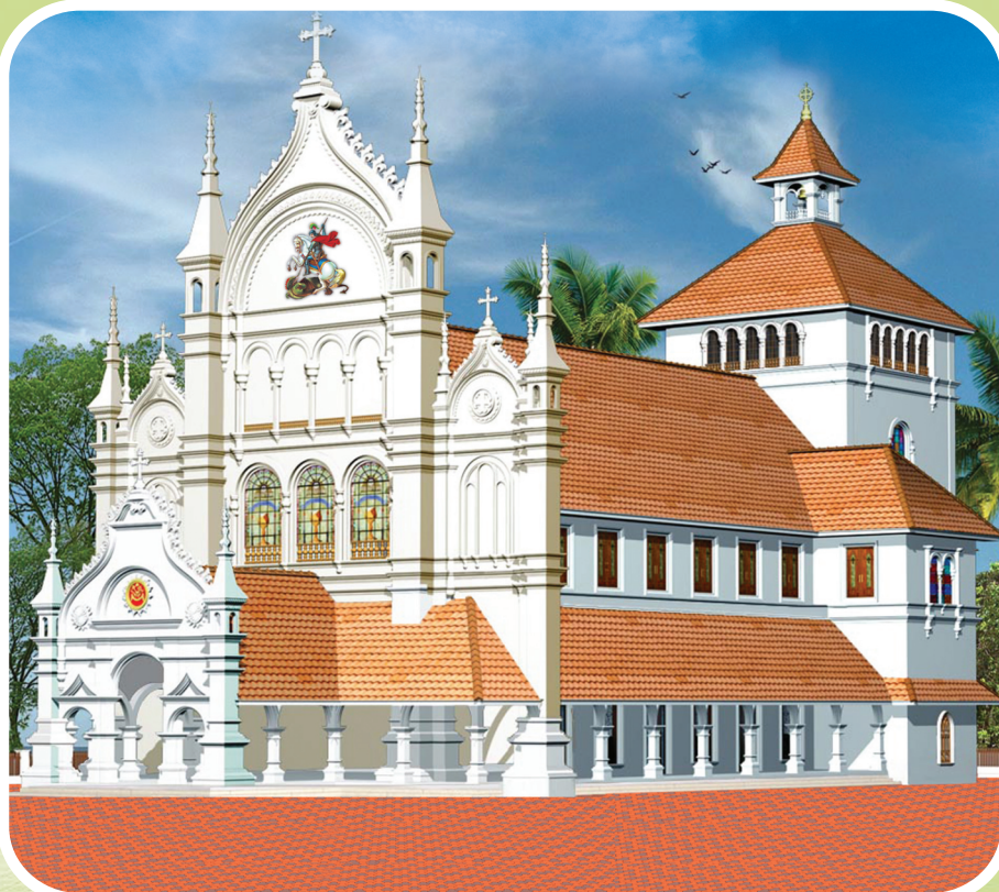
KALKKUNNEL MAR GEEVARGHESE SAHADA CHURCH